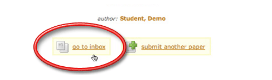
Opens your assignment inbox containing submissions and Originality Reports

After you submit a paper, our system will begin processing the paper and will generate an Originality Report within minutes. To view the report, click the inbox button on submission confirmation page. Your assignment inbox will open 1 2.